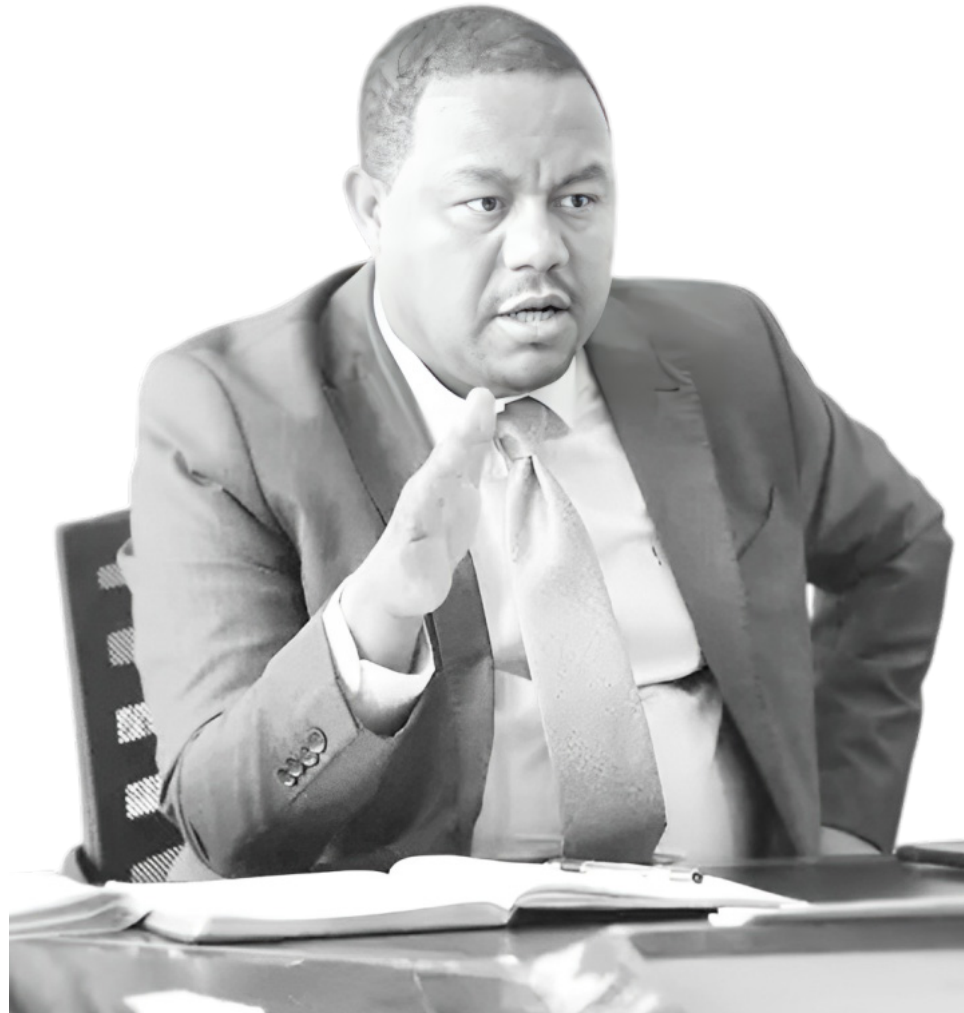
Habteyes Diro, Deputy Commissioner of the Addis Ababa Cooperatives Commission

Among the achievements through the cooperatives, the usual supply from ordinary private seller has been reduced by twelve per cent because of the cooperatives interaction with cooperative unions. The deputy Commissioner has presented different practices of several cooperatives