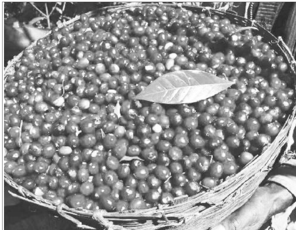
Ethiopia's best quality coffee

He further stated that Saudi Arabia and China respectively have imported 55,000 and 25,000 tons of coffee in the just ended Ethiopian fiscal