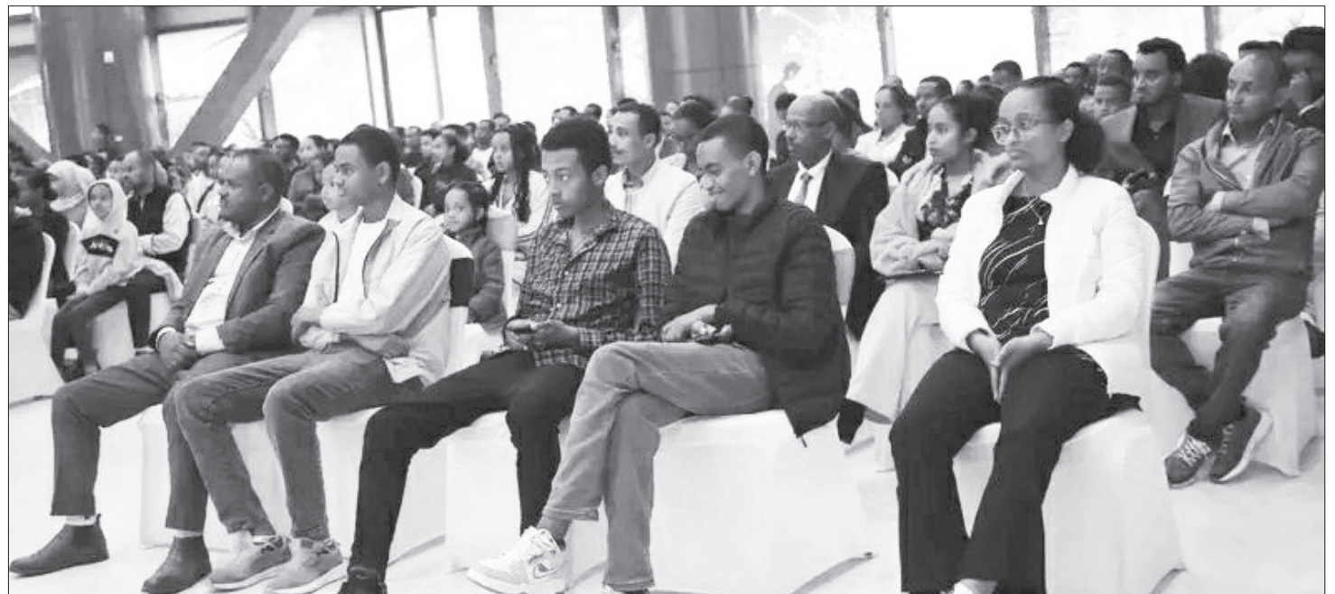
Participants of the 2024 AI Summer Camp commencement ceremony at the Science Museum

Ethiopian Artificial Intelligence Institute (EAII), a young institution itself started AI Summer Camp to cultivate talented youths in Artificial Intelligence (AI) technology and launched it three years ago. As part of its strategy to develop AI technology in Ethiopia, the institute in addition to investing in infrastructure and policy and reforms, gives due attention to human