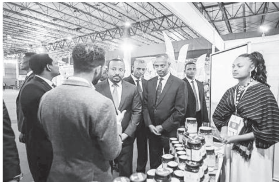
"Ethiopia Tamirt" expo 2024 promoted local products

Beyond fostering business connections, industrial expos also serve as invaluable