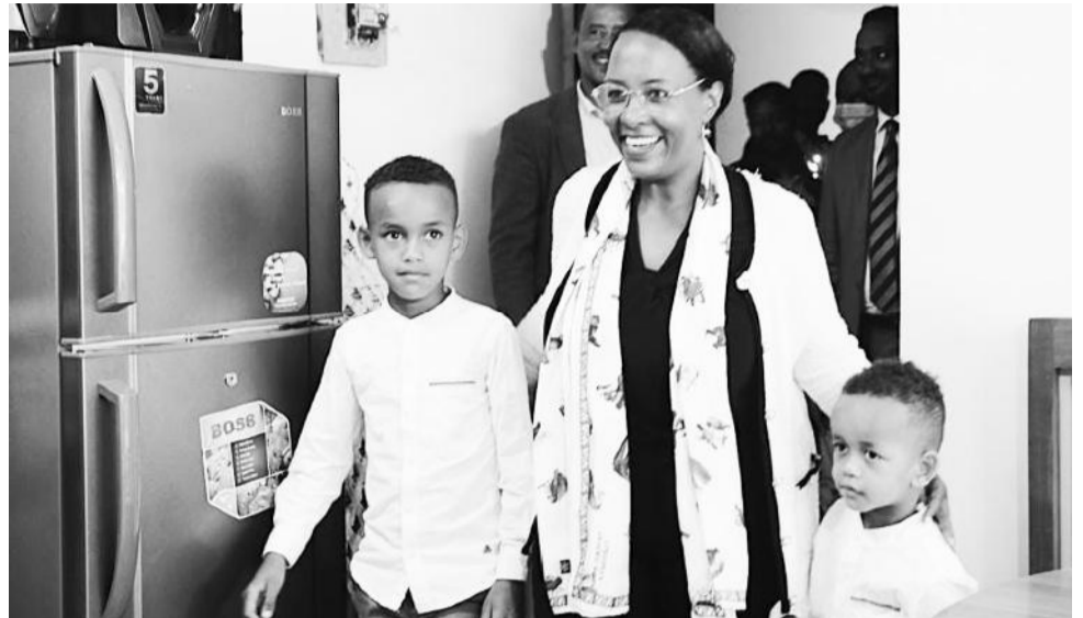
Kind-hearted City Mayor with children of a relocated family at their new home provided by government