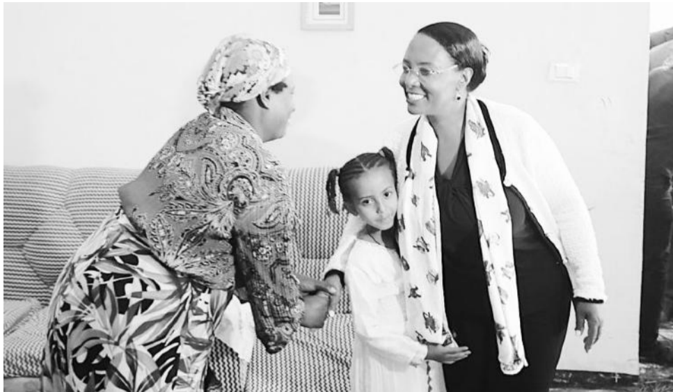
City Mayor visiting a relocated, turned around family members at their new home