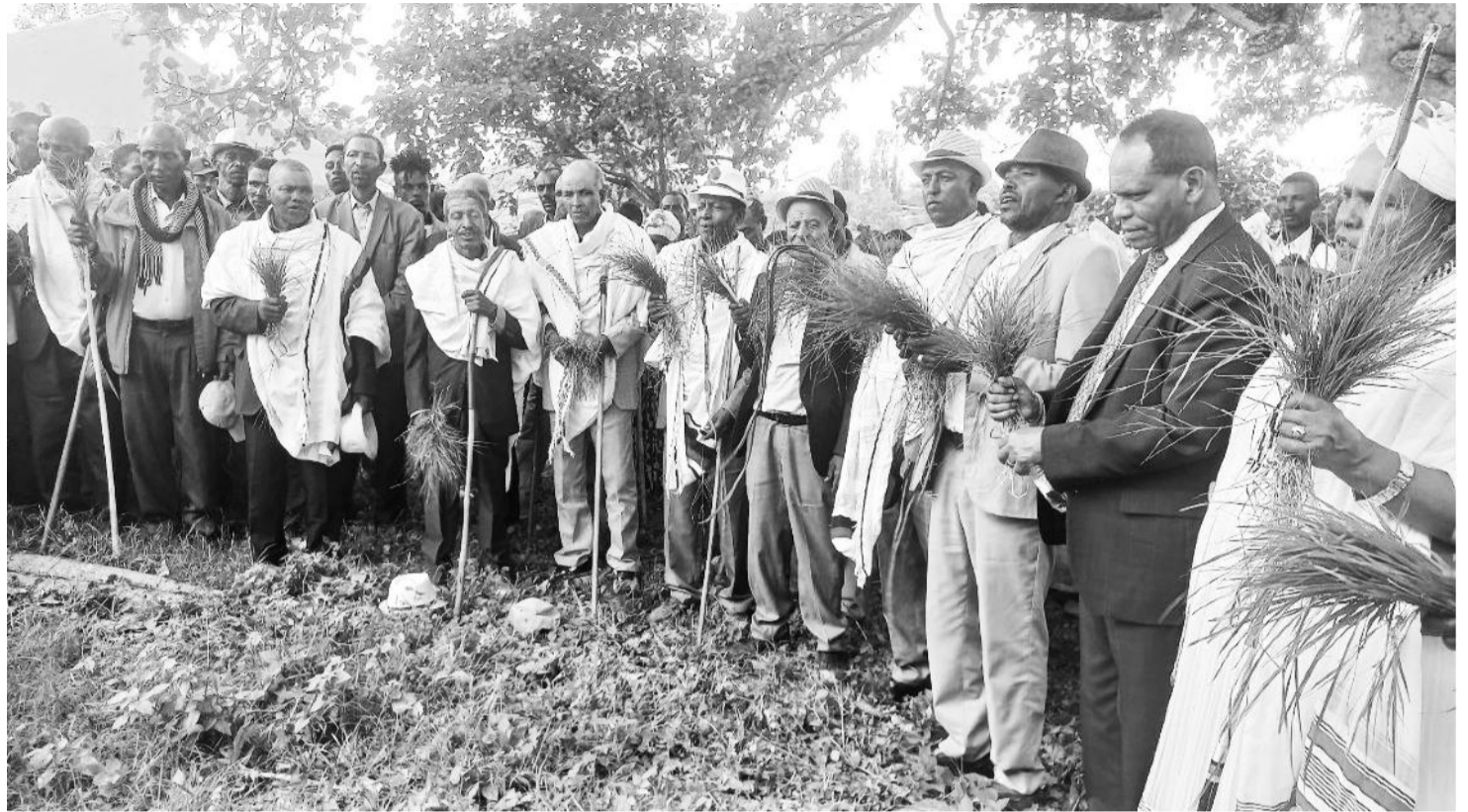
Traditional arbitration system in Oromia State

Recently, he organized a traditional arbitration event at Dukem Town to facilitate