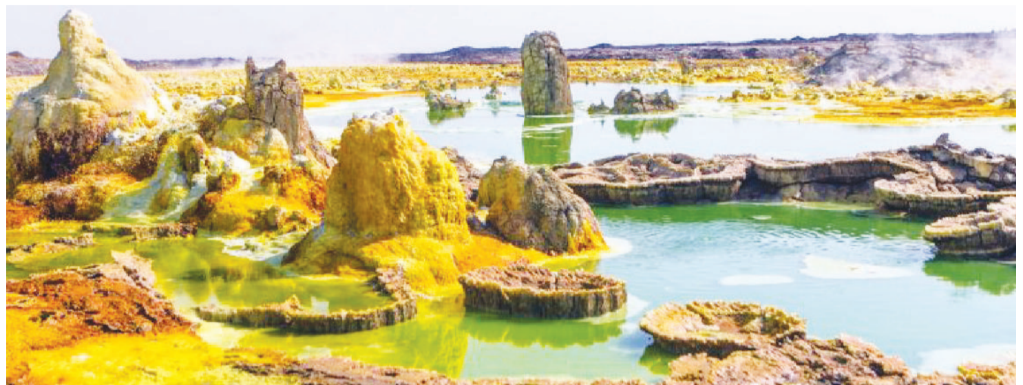
Dallol, Danakil Depression, Afar State

From the largest mountains in Africa to the