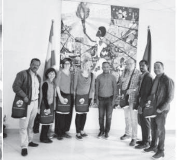
Left: project launching date, December 2016. Right: STEM educators with then BDU president