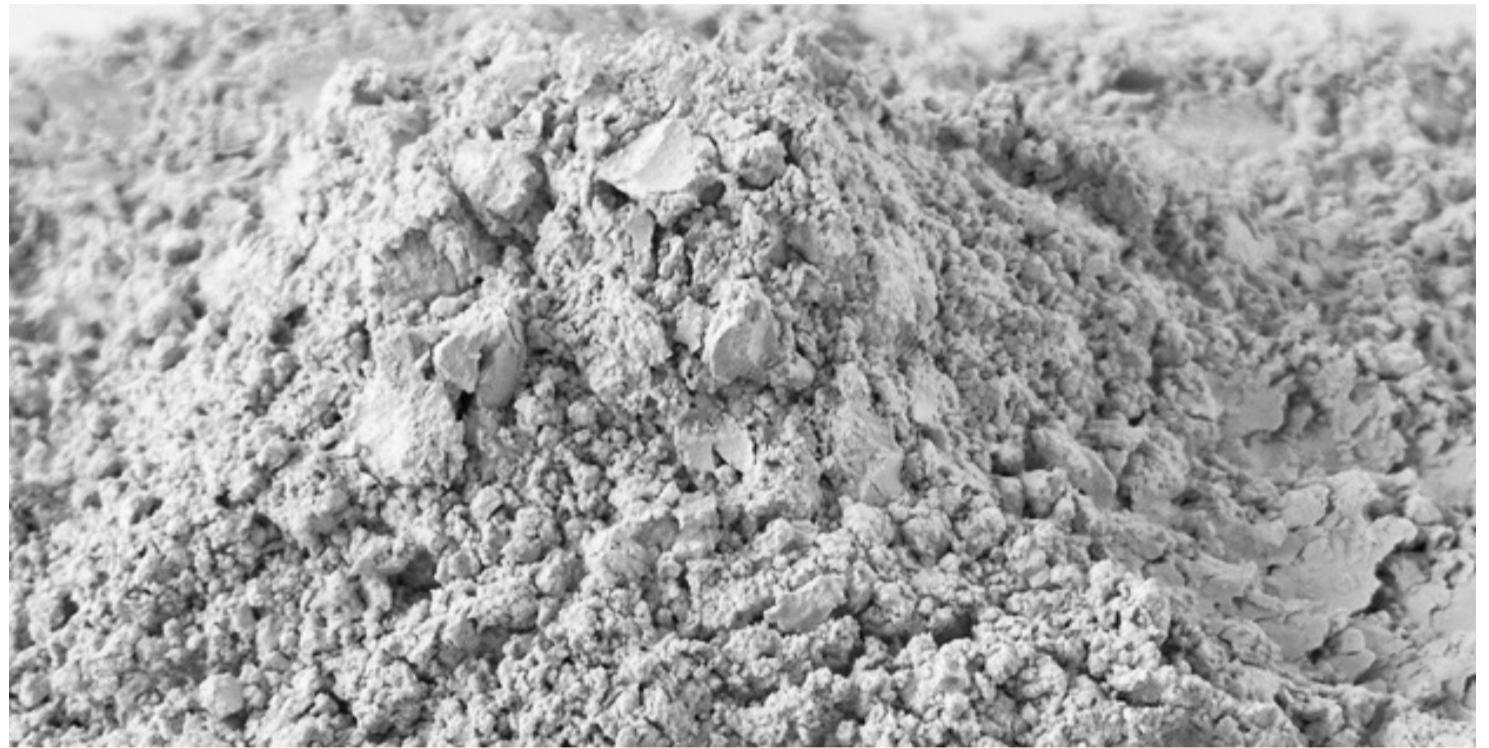
The Abijata Soda Ash Project

Through partnerships and collaborations, local employees receive training and exposure to best practices in soda ash production. This not only improves their skills but also creates a pool of expertise that can be leveraged for future industrial development. The knowledge exchange between international experts and local professionals contributes to the overall growth and competitiveness of Ethiopia's manufacturing sector.