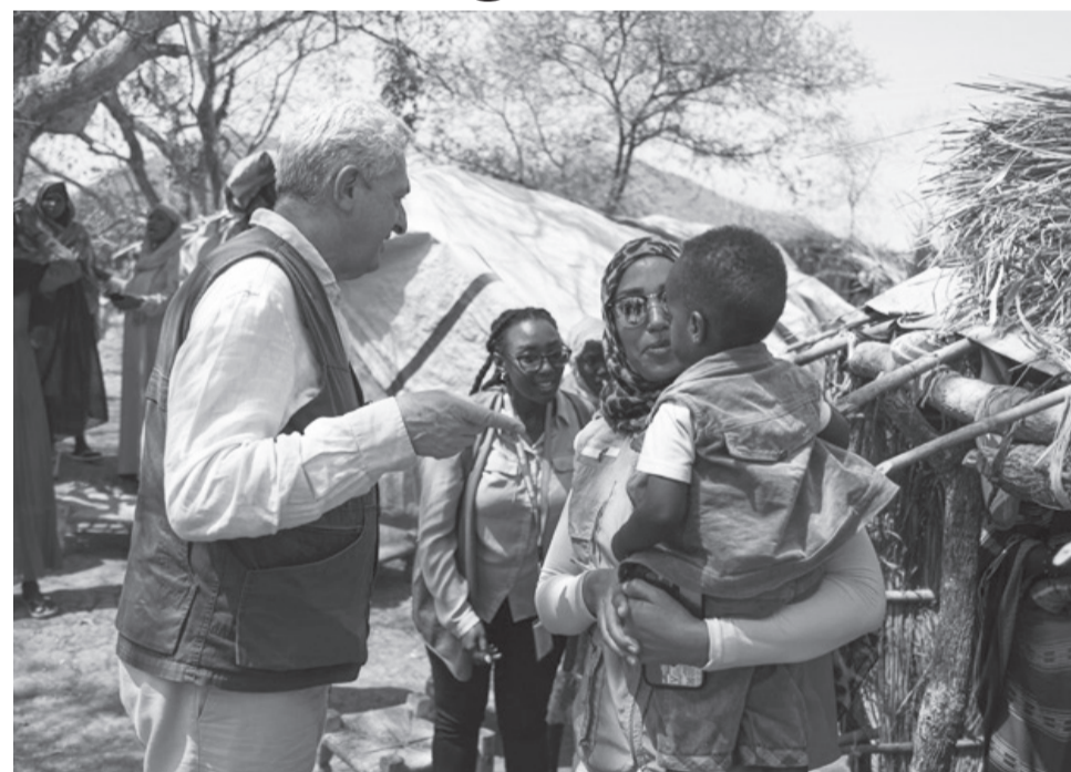
Flippo and Teyba during the visit

“It’s heart-breaking to see women and the elderly, particularly children suffer this much due to misunderstandings between the parties to the conflict back home. Our people and government are committed to share what they’ve to the people of Sudan