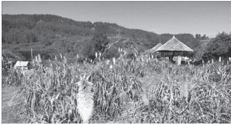
Choke Mountains Ecovillage

In addition to its natural wonders, the park holds significant cultural heritage. It is inhabited by diverse ethnic groups, including the Oromo people, who possess a distinct cultural identity and practice rich traditional customs.