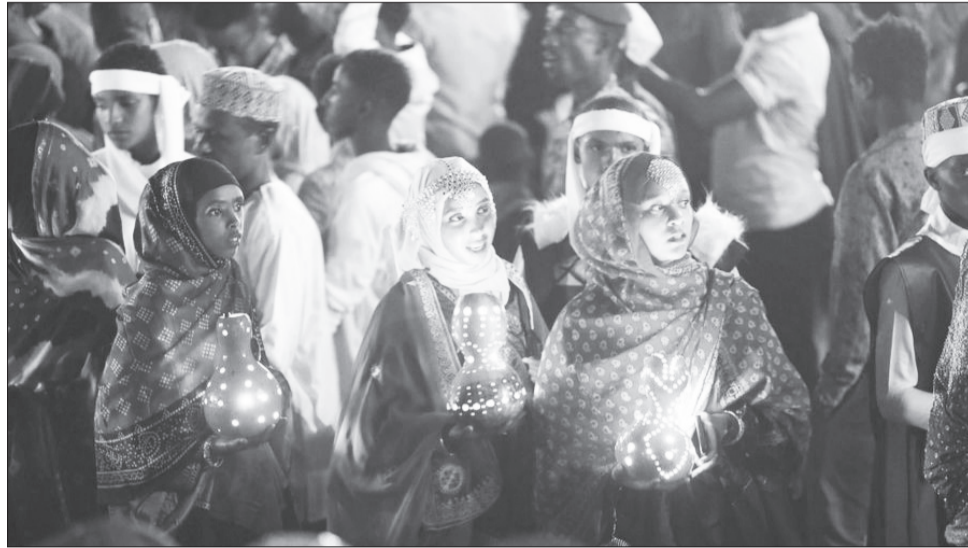
Celebration of Shuwal Eid festival by the Harari people

Bale Mountains National Park, located in the Oromia State, is also another blessing that captivates visitors with its breathtaking landscapes. The park, established in 1970, covers a sizable area of approximately 2,150 square kilometers and lies about 400 kilometers southeast of Ethiopia's capital city, Addis Ababa. This National Park provides a sanctuary for a variety of wildlife species, including the critically endangered Ethiopian Wolf, which finds its habitat within the park's renowned Sanetti Plateau. Other captivating inhabitants of the park include the Mountain Nyala, Menelik's Bushbuck, warthogs, and a vibrant array of bird species.