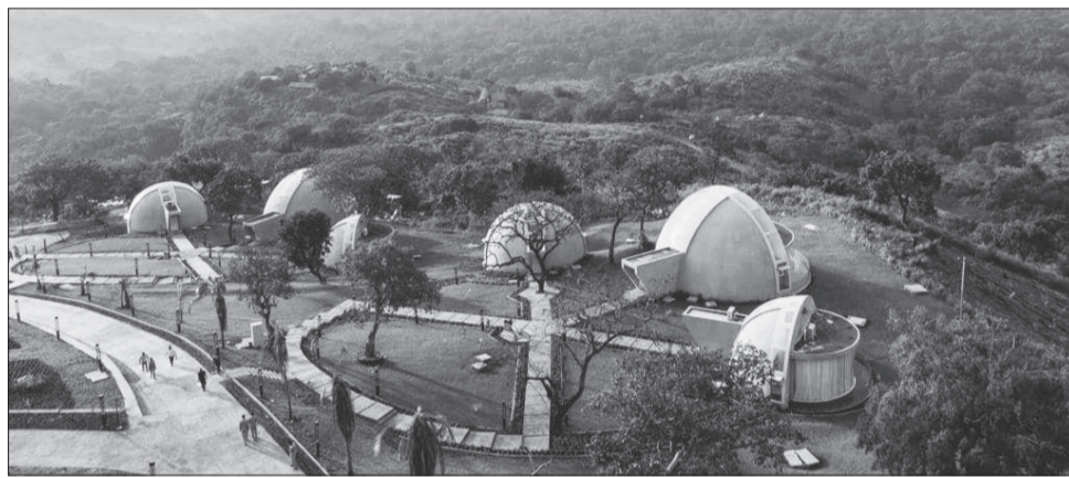
Partial view of the newly inaugurated Chebera Elephant Paw eco-lodge