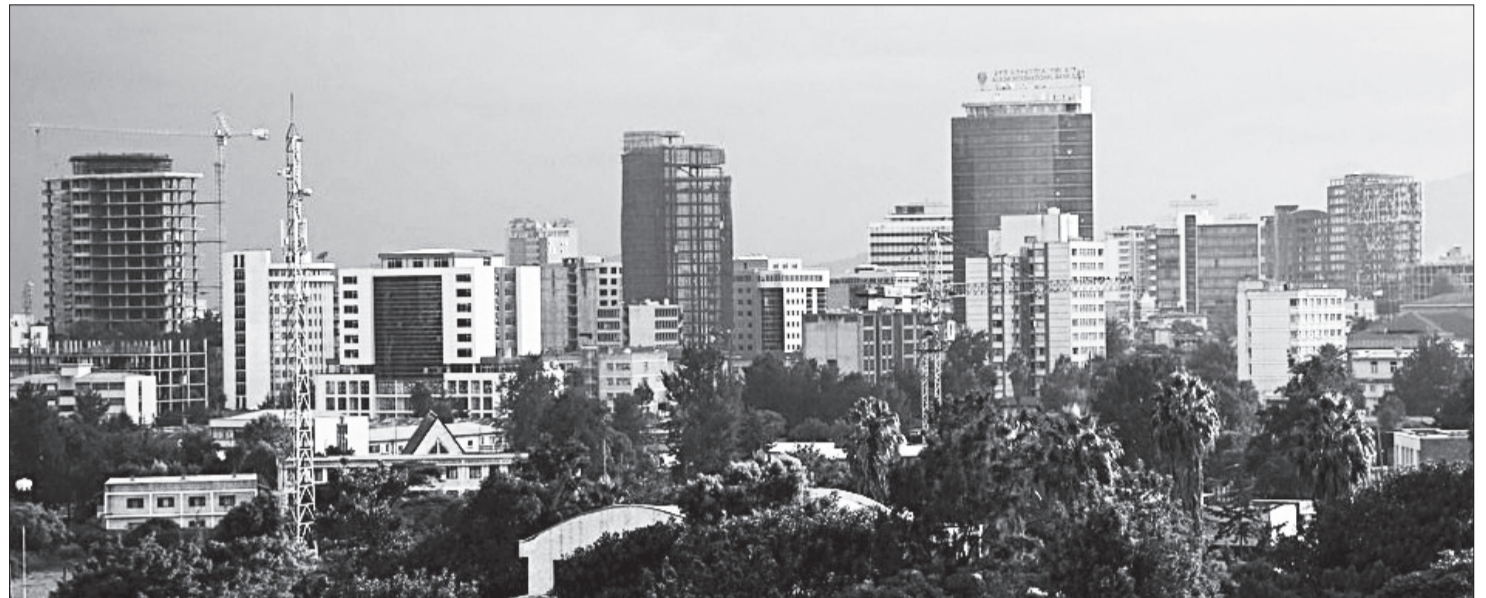
Ethiopia's economy on the rise in 2023 - EXPOGROUP

Urban employment levels have not recovered fully, some households and firms continue to report income losses, and poverty is estimated