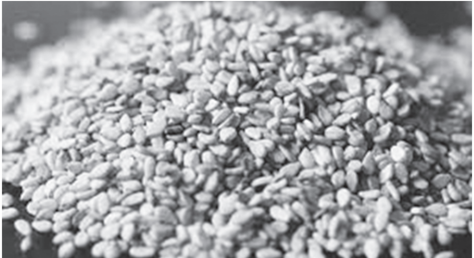
The white gold is highly produced in Ethiopia

system led sesame production and productivity very poor. The production is concentrated in Southwestern and northwestern parts of Ethiopia. Sesame production in most areas is carried out under traditional production systems which results in low production and productivity.