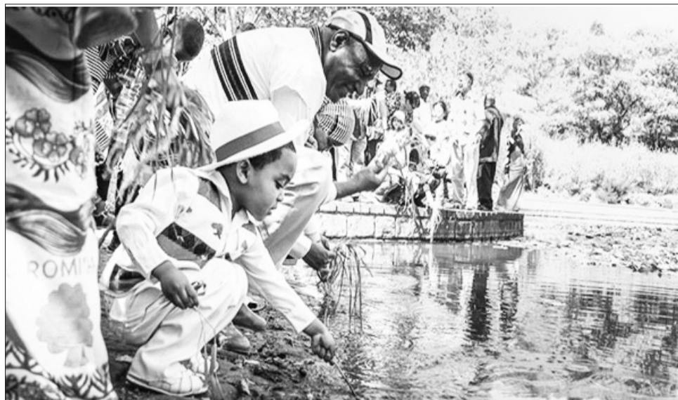
Ethiopia: A nation of peace-lover people celebrating diverse festivals in peace

attire, came together in a spirit of camaraderie and solidarity, highlighting the Ethiopian people's deep connection with their cultural heritages. The peaceful and inclusive nature of the Irreecha celebration at Hora Finfine in Addis Ababa and Hora Arsede in Bishoftu demonstrated the remarkable ability of Ethiopians to celebrate their traditions harmoniously, fostering an atmosphere of joy, understanding, and peaceful coexistence.