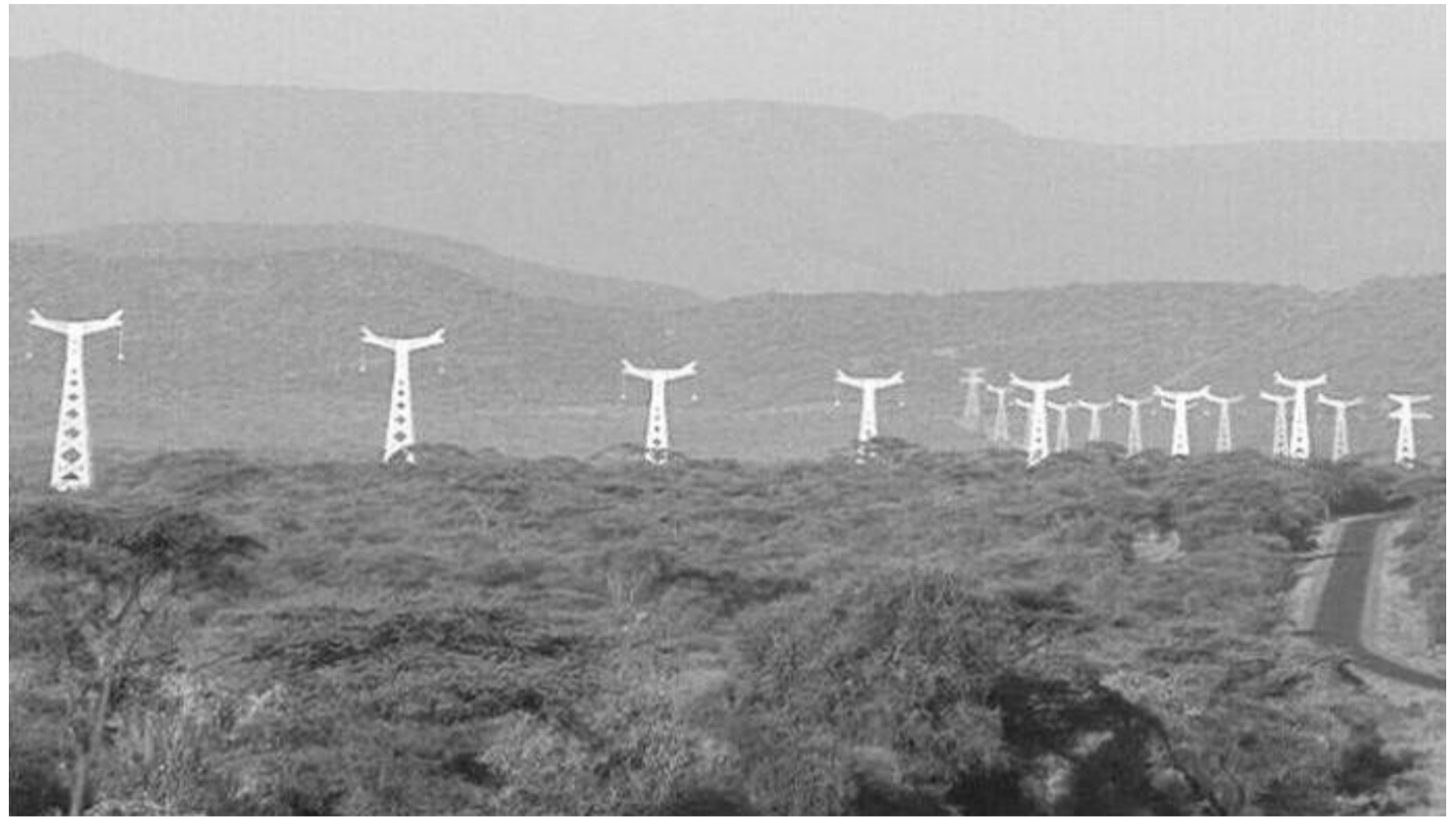
The Ethiopia-Kenya transmission interconnection line

To mitigate the overdue of payment due to the civil war in Sudan, EEP is working closely with the Ethiopian Ministry of Foreign Affairs and the Sudanese Embassy