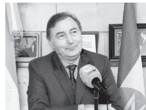
Ambassador Gustavo Teodoro Grippo

"Not only have we concluded a joint project on the development of bioinoculants for sustainable agriculture, but also working on a project for the improvement of Begait beef and dairy production."