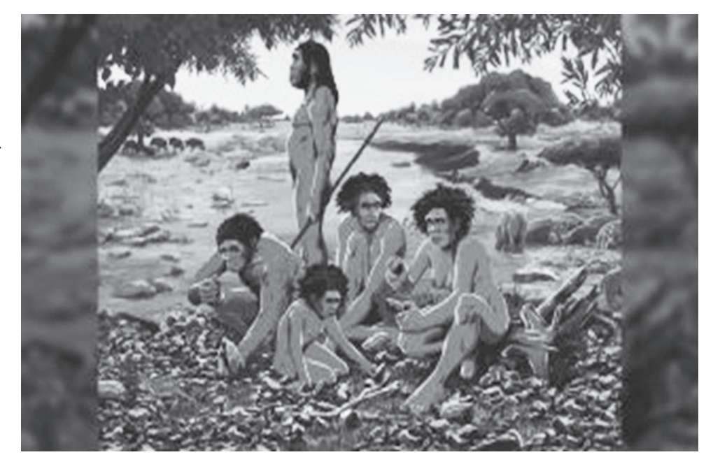
An illustration showing ancient human relatives making hand axes out of obsidian more than 1.2 million years ago in Ethiopia

The scientists focused on 575 artifacts made of obsidian at a site known as Simbiro III in Melka Kunture. These ancient tools came from a layer of sand dubbed Level C, which fossil and geological data suggest is more than 1.2 million years old. These obsidian