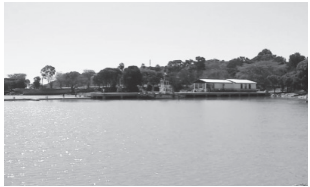
Gorgora Project nearing completion