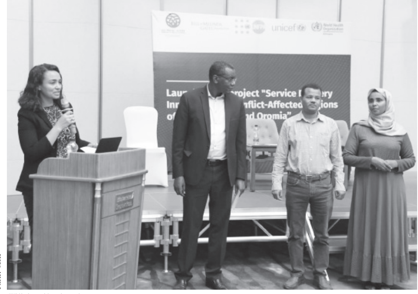
While launching the project

As part of this, the three UN agencies, namely UNICEF, UNFPA, WHO, together with the Ministry of Health, have designed a project that can be implemented in areas affected by conflicts.