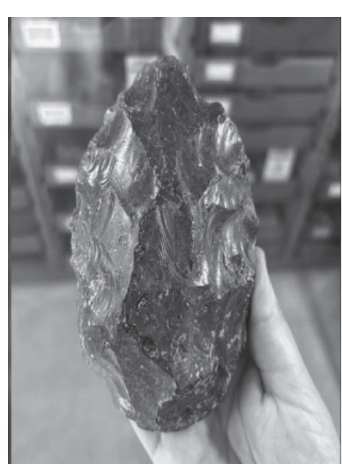
Obsidian hand ax crafted by an ancient human relative more than 1.2 million years ago.

artifacts included more than 30 hand axes, or teardrop-shaped stone tools, averaging about 4.5 inches (11.5 centimeters) long and 0.7 pounds (0.3 kilograms). Ancient humans and other hominins may have used them for chopping, scraping, butchering and digging.