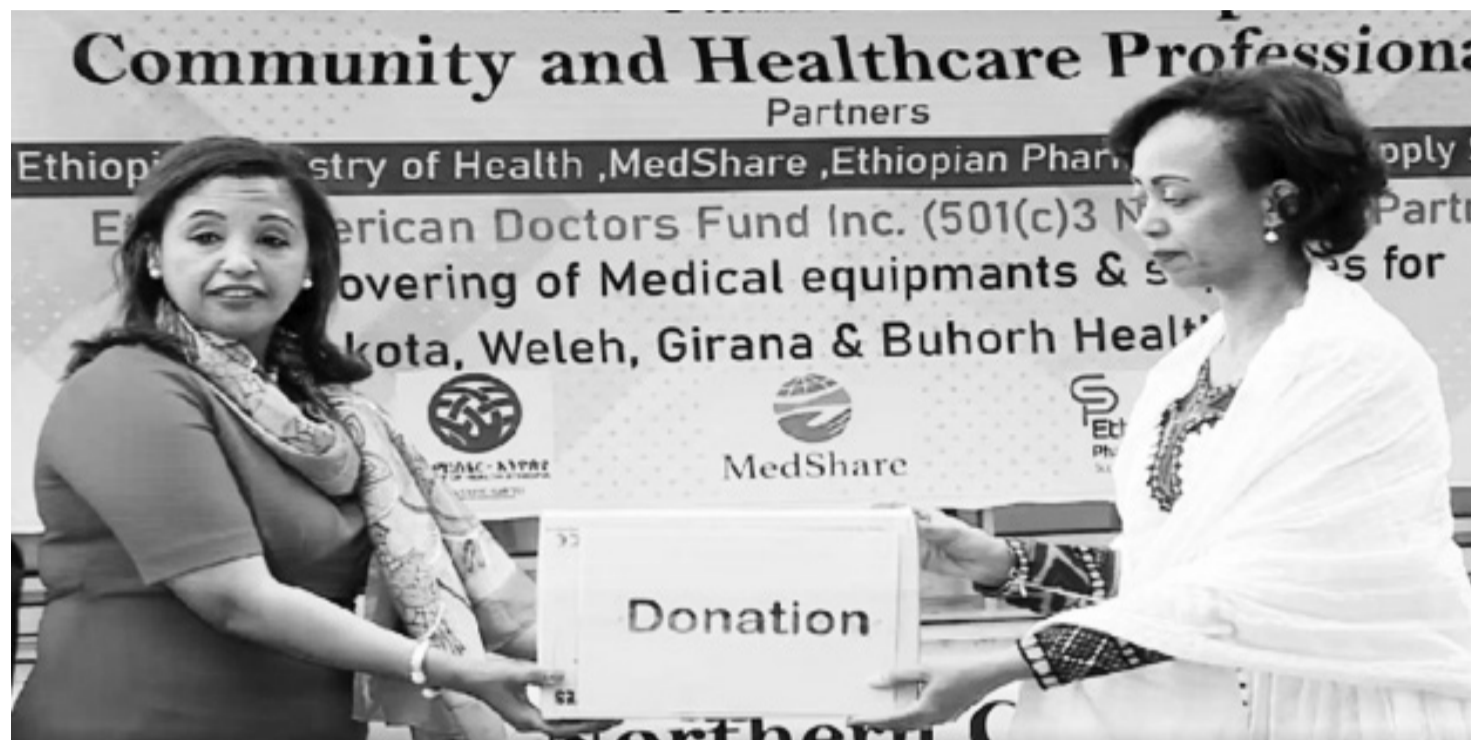
Representative of Northern California Diaspora community and Health Professionals handing over medical equipment & supplies to Ministry of Health

After the peace agreement, further activities