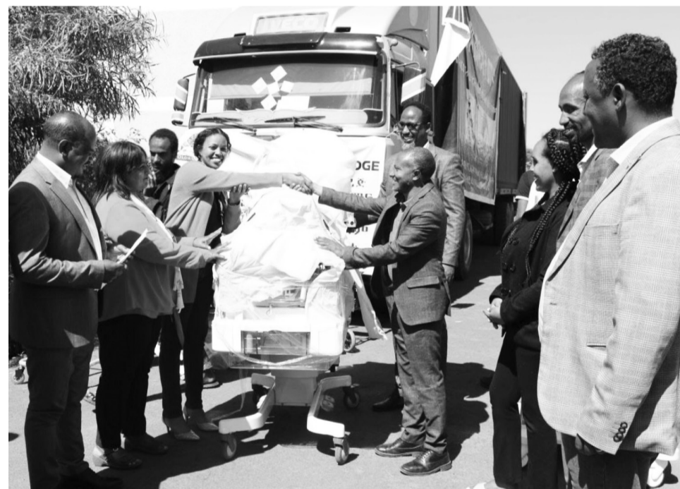
Woldia Comprehensive Specialized Hospital receiving medical equipment donation from Human Bridge Humanitarian Organization

have been ongoing to provide humanitarian aid and restore the health system into its former state in Tigray State joining hands with concerned stakeholders, she added.