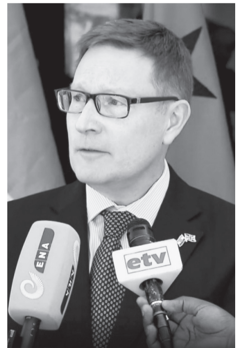
Amb. Darren Welch

"The progress is positive so far and needs to obviously be continued. These things can be difficult to implement but with goodwill and determination and a positive attitude on both sides, I see no reason why shouldn't continue in a positive trajectory. We very much hope that will be the case. Ethiopia needs peace across the whole country and