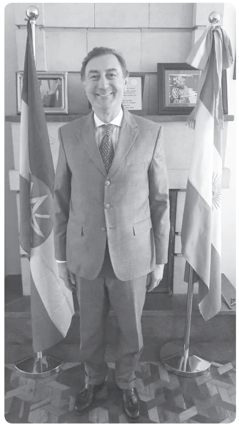
Amb. Gustavo Teodro Grippo, Argentina Ambassador to Ethiopia

When asked how Argentinean people express Ethiopia, Ambassador Gustavo said, Argentinian people know best about Ethiopia. This is because of various reasons; Ethiopia is a great African nation that had never been colonized. This is a very important point to us. For Argentina, Ethiopia is a very good example of freedom and anti-colonialism struggle. Ethiopia's diplomatic relation with Argentina in this regard has an important significance for it values independence as a paramount issue. This is reflected in the issue of Malvinas