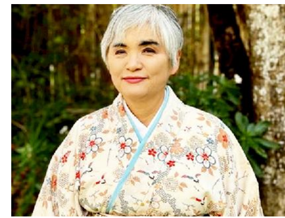
Amb. Ito Takako

(Please read ambassadors' messages on page 16)