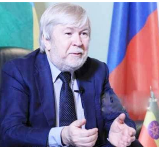
Amb. Evgeny Terekhin