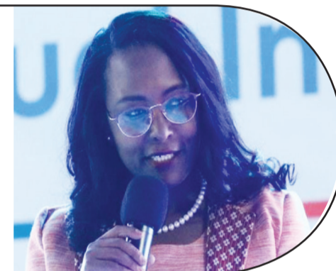
Adanech Abiebie, Mayor of Addis Ababa City

We welcomed our guests of the 17 th IGF in Addis Ababa. Addis Ababa City Administration is working to make the city a smart city and ICT is vital to realize it. Addis Ababa is working to expand the ICT infrastructure and the IGF would stimulate the sector in our city.