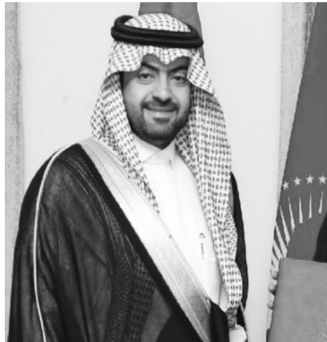
Kingdom of Saudi Arabia views the peace agreement as an agreement of

prosperity and stability for Ethiopia, adding that the implementation of the agreement will enhance foreign direct investment in the country.