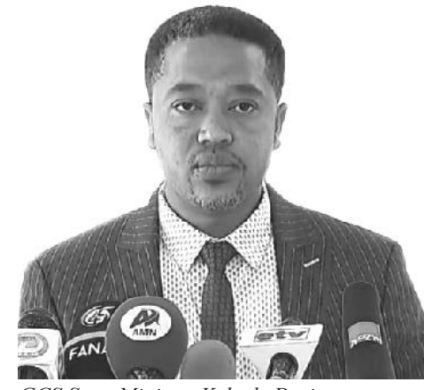
GCS State Minister Kebede Desisa the army are paying for the sake of their country and the people.

According to the State Minister, the day will also be observed by all public and private institutions across the country to remember the atrocities committed by the terrorist group against the national army and honor the sacrifice that members of