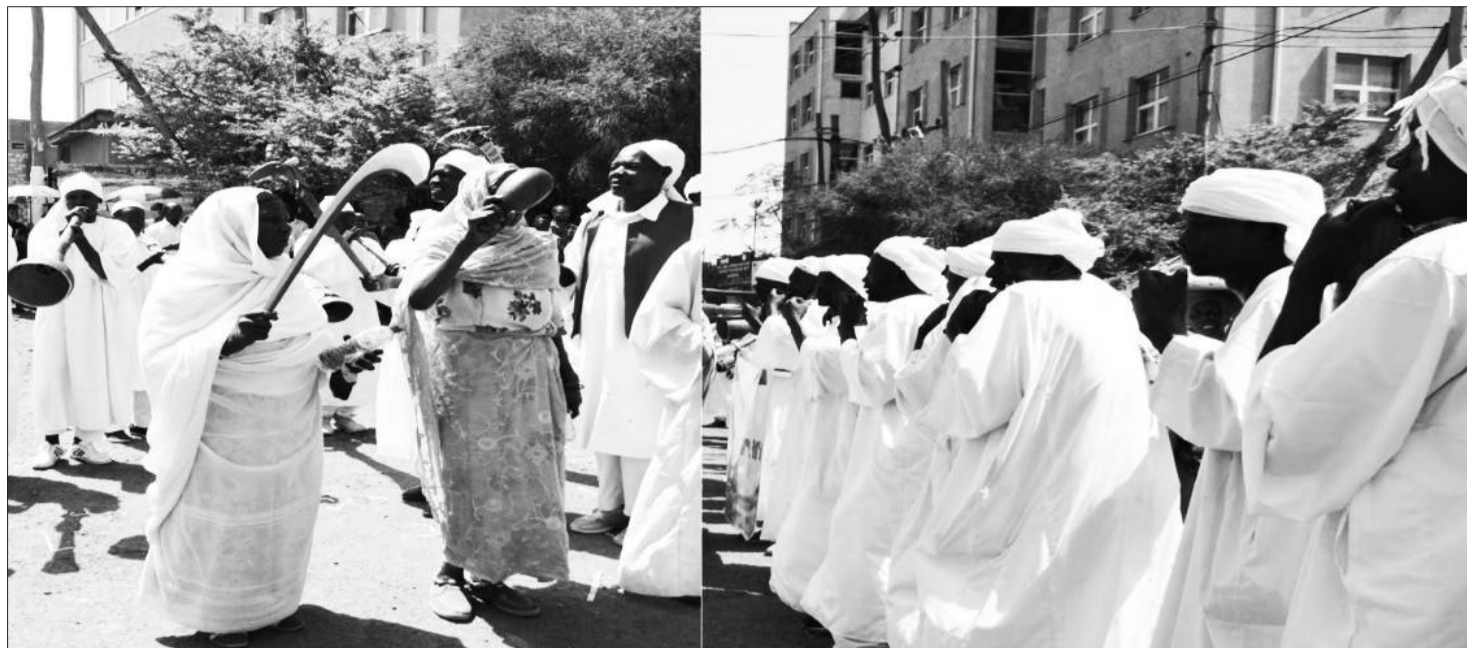
Cultural dances in Benishangul Gumuz state as part of tourist attraction means

"The Tourism Transformation has been focused on building Ethiopia's natural, historical and cultural resources with a view to strengthening the tourism sector, identifying pressing value-chain gaps and intervening to allay these gaps based on tangible and scientific reasons. Together, all Ethiopians in general and Benishangul Gumuz community in particular have to work hand in hand to make tourism one of the leading economic sectors