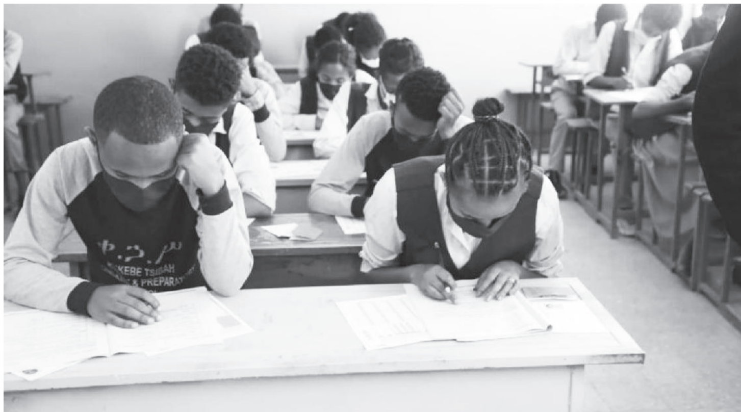
Students taking university entrance exam at higher learning institutions

It is also undeniable fact that Ethiopia has left with a long journey to do away with schools over crowdedness; teacher’s limited training, low learning outcomes to prettily swap the trajectory of the education industry. It is quite decisive to well comprehend that population growth in Ethiopia and the influx of refugees has placed additional pressure