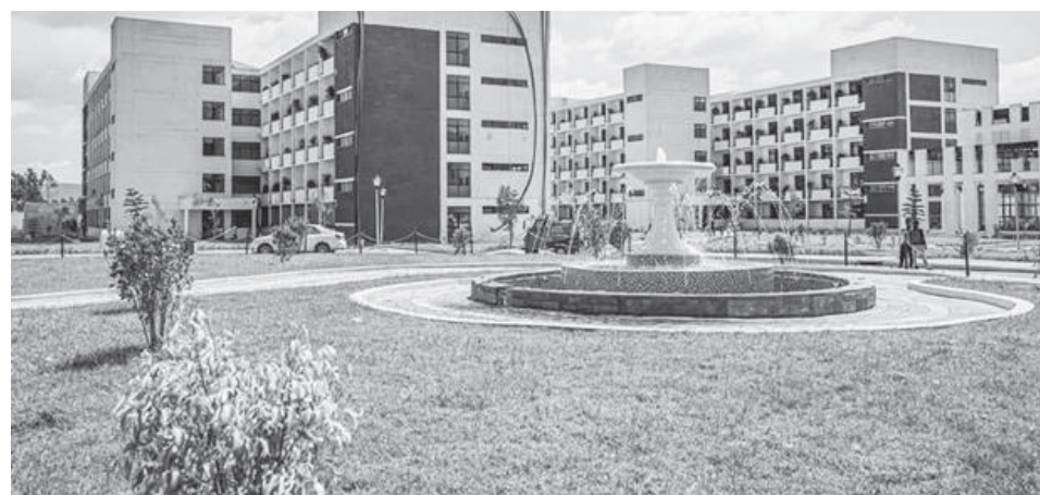
Burayu Talent Development School

On the inaugural ceremony of the Burayu Talent Development School, the Premier said: “The world is highly evolved in technology than it has ever been. To reap the economic and other benefits of technology, it is imperative that Ethiopia produces professionals with advanced knowledge in the field. We need more talent development centers like Burayu Talent Development School so that talented young people can help their country become technologically competent while developing their skills and pursuing their passion. Local residents who contributed in various ways from