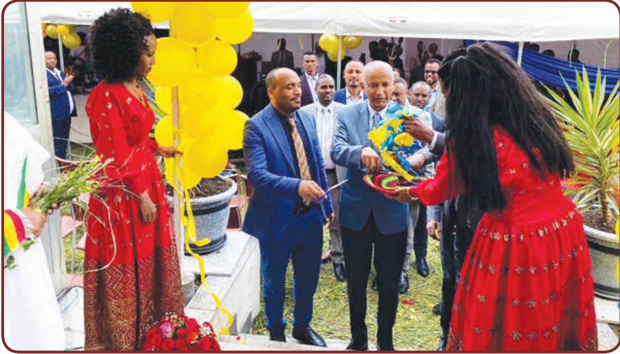
Fana Broadcasting Corporation (FBC) has been inaugurated its media complex built in Dese City, Amhara Regional State at a cost of Birr 100 million. The media complex laid on 450 square meters is an 8-story building that includes an up-to-date radio and television studios, meeting hall and multipurpose rooms. Fana Broadcasting Corporation is opening FM stations in different parts of the country to reach the residents of the respective areas. Fana has been serving the residents of the city and the surrounding parts in Amhara and Afar regions through its FM 96.0 for about 12 years. The media complex will help to increase the access, content in terms of quality and quantity.