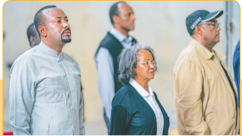
Right-to-left: PM Abiy Ahmed, President Sahlework Zowde, Deputy PM and FM Demeke Mekonnen attending the inaugural event of the second turbine power generation at the GERD project, Guba Woreda, Beni Shangul Gumuz Regional State.

The Grand Ethiopian Renaissance Dam (GERD), a mega project that has been shaping Ethiopia to a new horizon is currently nearing completion while it has been generating power from its two power units. The reservoir filling in the Africa's mega dam has also been completed successfully over the week.