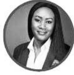
MS. CHIDO CLEOPATRA

MINISTER · FDRE MINISTRY OF YOUTH, SPORTS AND CULTURE