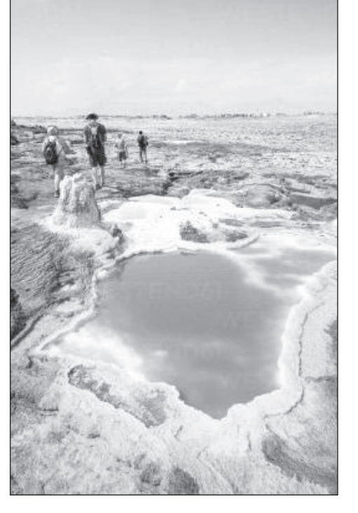
Hot springs and sulphur ponds, Dallol Depressions, Afar

the Ministry of Heritage and Tourism to complete the design work to build the Lucy Museum in Afar, where Lucy Museum is located.