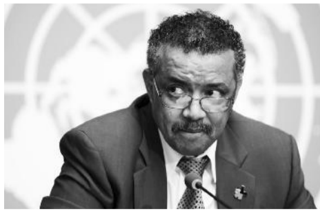
WHO's Director General, Tedros Adhanom (PhD)