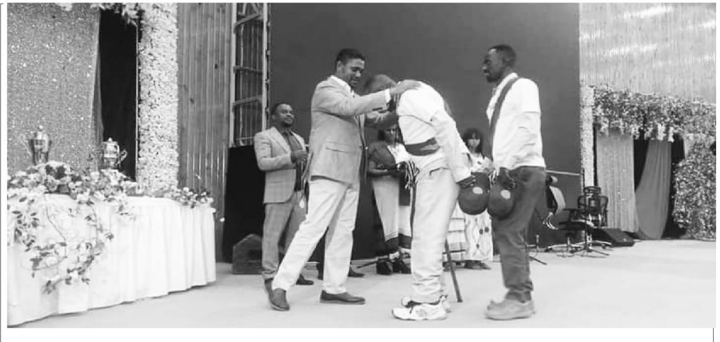
Effective entrepreneurs in Oromia State are encouraged for better success

Recently, a five-day Bazaar Market Enterprise Development Transfer Program was also held in Adama, Oromia State. A