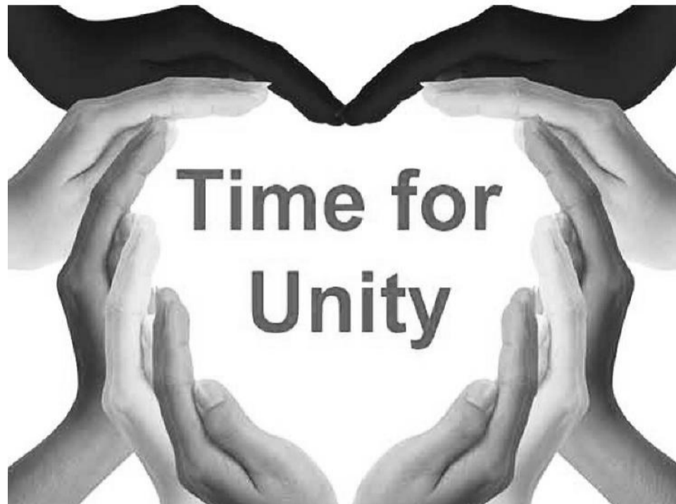
Where there is unity, there is always victory