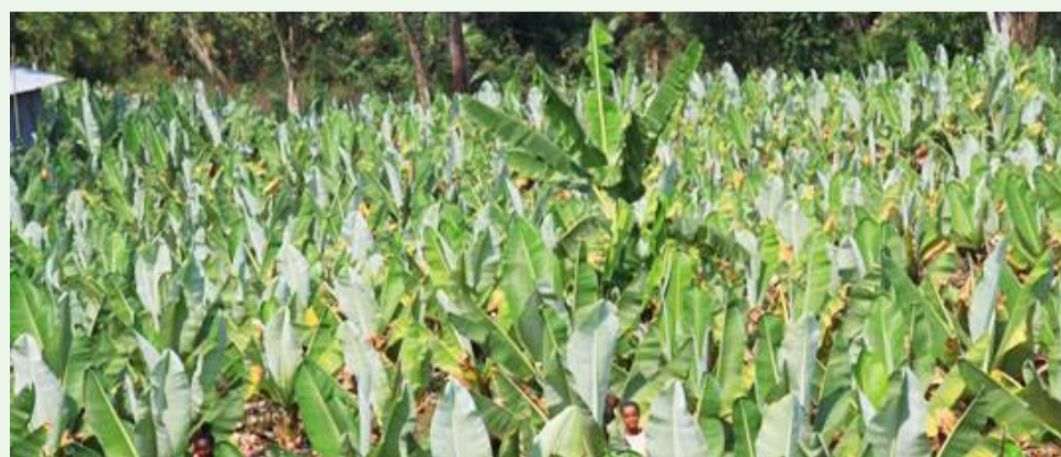
University's enset seed development and multiplication

Scientists laud the significance of enset for