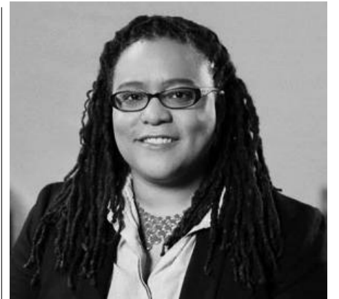
Senator Kim Jackson

It has also urged the joint investigation of the Ethiopian Human Rights Commission and the United Nations Office of the High Commissioner for Human Rights to expand their scope; and, investigate Crimes against Humanity, Ethnic Cleansing and the Crime of Genocide against the people of Wolkait Amharas in the thirty plus years where TPLF forcefully annexed and ruled over the territory.