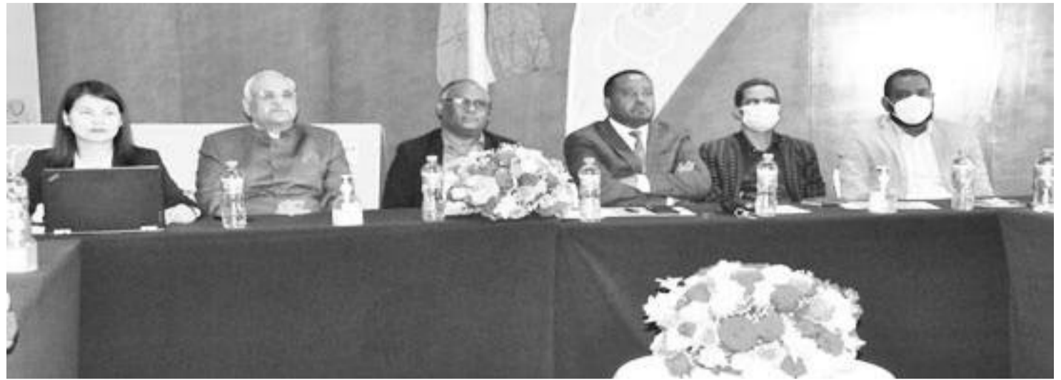
ECWC agrees to work in collaboration with Rising Hongfa Group in import substitution

The Director General further accentuated that the company has extensive experience in the field of construction inputs, recycling fabric materials, aluminum inputs, concrete