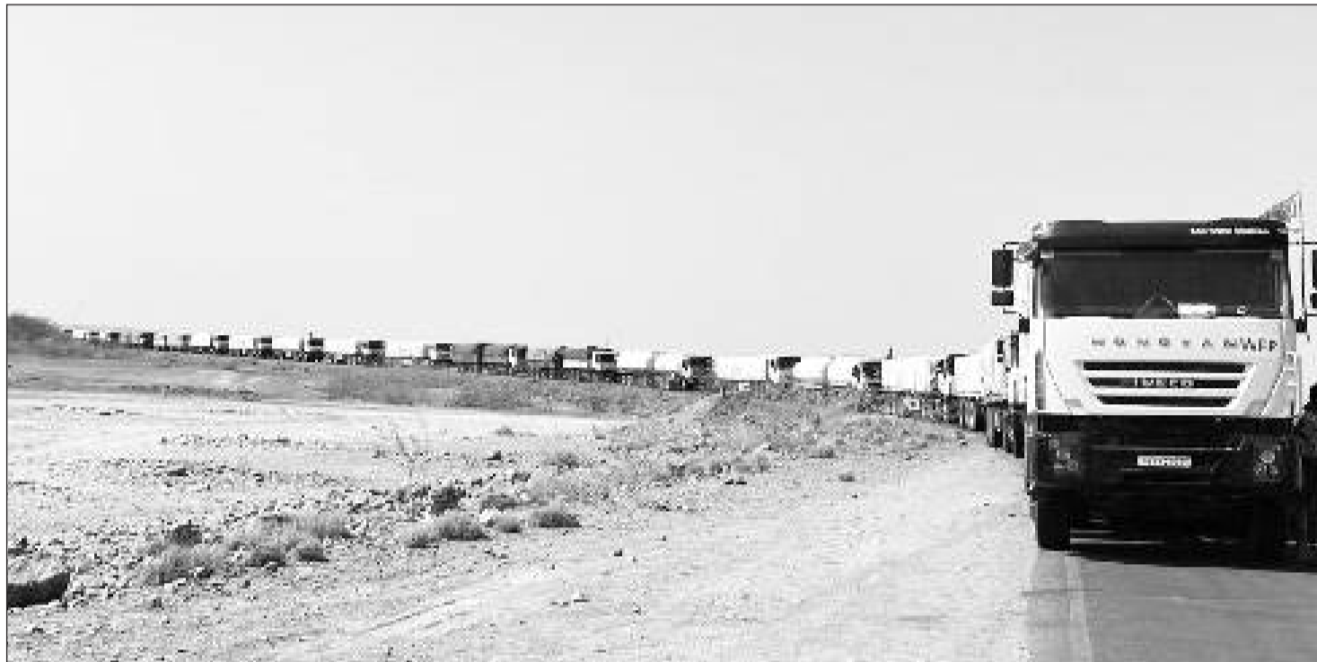
More trucks carrying humanitarian items arriving at Tigray regional capital

On the heels of the humanitarian truce, a convoy consisting of some 20 trucks arrived in Mekele on 1 April with 500 tonnes of food aid. International Committee of the Red Cross (ICRC) noted that a second convoy to Tigray this month carrying medical items, emergency food, and water treatment supplies along with essential household items arrived in Mekelle.