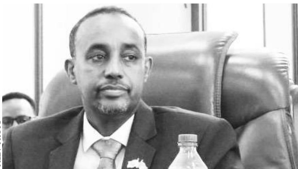
— Somali Prime Minister Mohamed Hussein Roble.

Key events are being held under tight security