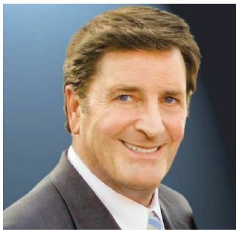
The U.S. Congressman, John Garamendi