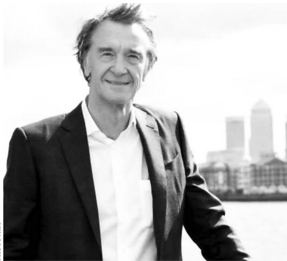
Sir James Arthur Ratcliffe, the British billionaire who owns INEOS Automotive that funded Eliud Kipchoge's 2019 special marathon

Prices of the new Land Rover Defender, sold by Inchcape Kenya, can top the Sh20