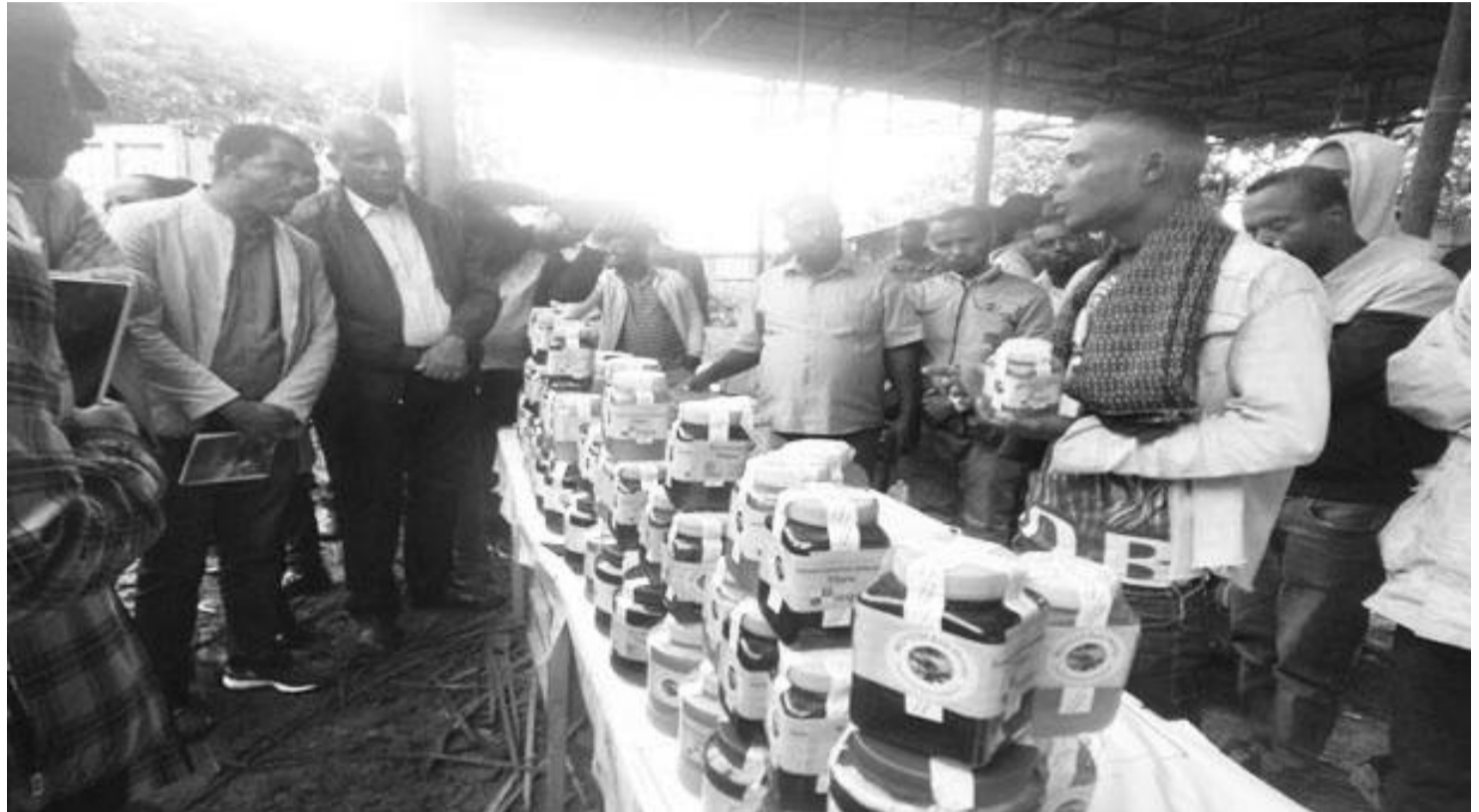
Honey producers are reaping fruit of their effort